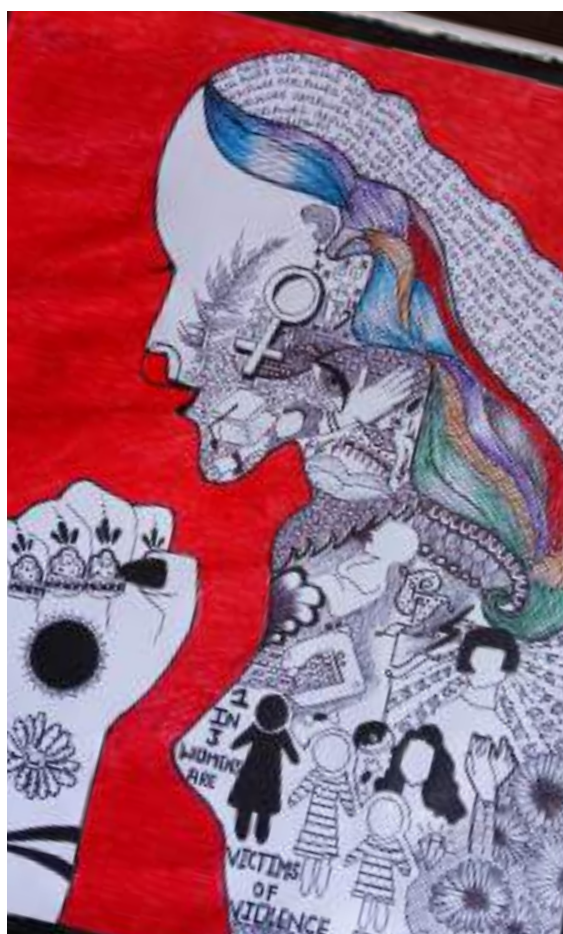
Art credit: Nancy Sahu

The program address key areas like legal awareness, digital proficiency, communication skills and financial literacy. We strive to create a supportive environment where women can find support, ask questions without being judged and unlock their true potential, building a more equitable and inclusive society.